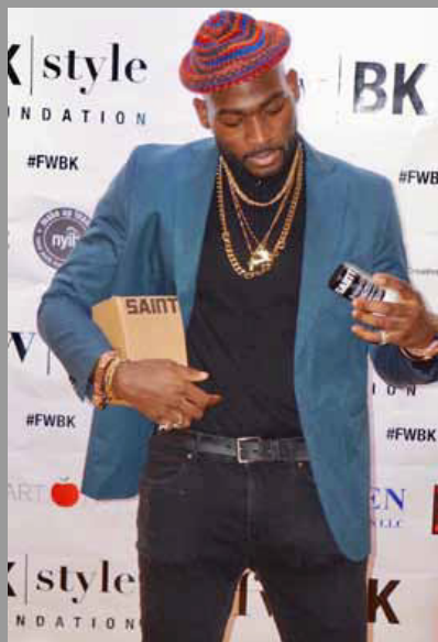
SAINT NEW YORK